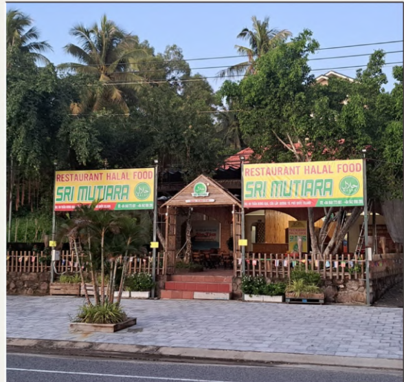
LUNCH AT SRI MUTIARA RESTAURANT