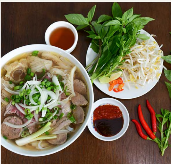
DINNER AT SRI MUTIARA RESTAURANT