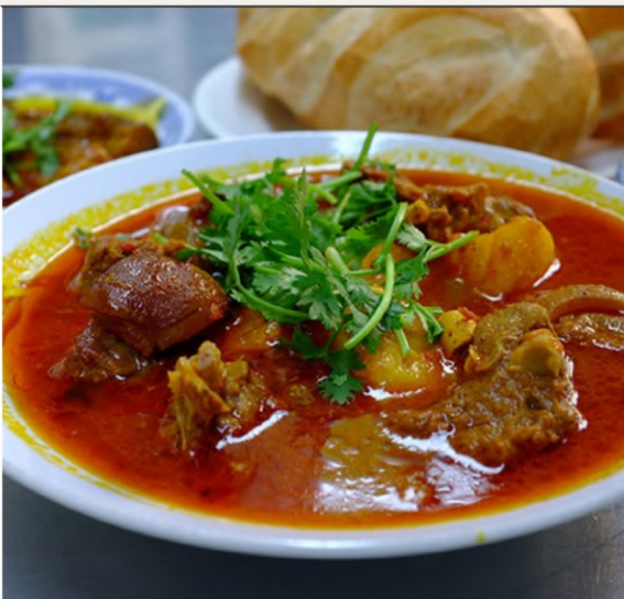
DINNER AT SRI MUTIARA RESTAURANT