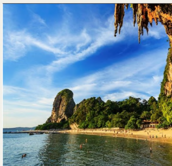
4 ISLAND TOUR PHRANANG BEACH