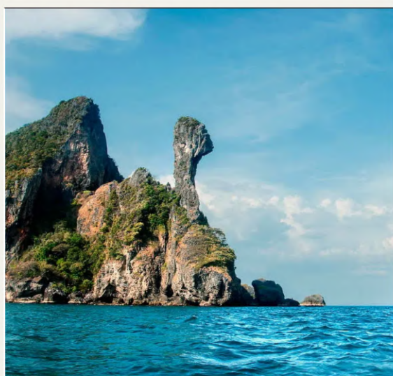
4 ISLAND TOUR CHICKEN ISLAND