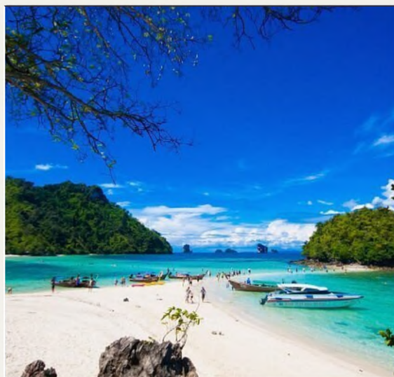
4 ISLAND TOUR TUB ISLAND