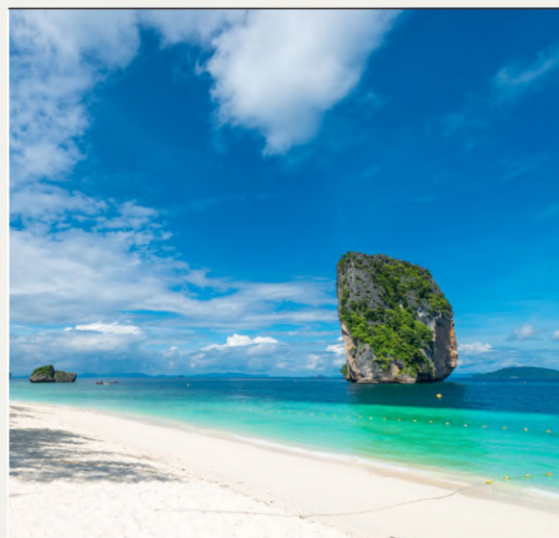
4 ISLAND TOUR PODA ISLAND