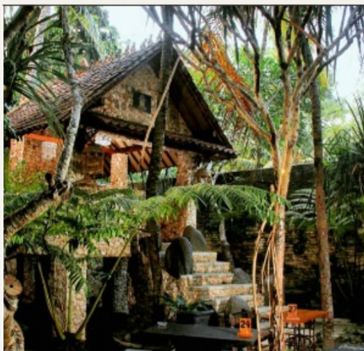
DINNER AT WARUNG POHON OMAH