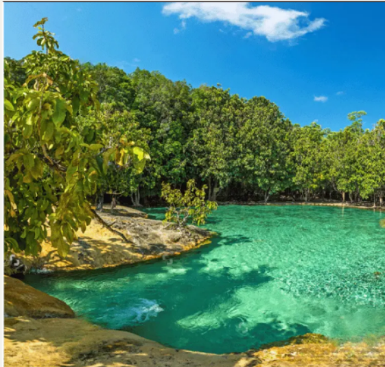
JUNGLE TOUR EMERALD POOL