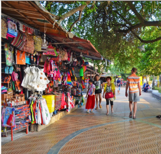
AONANG SHOPPING STREET