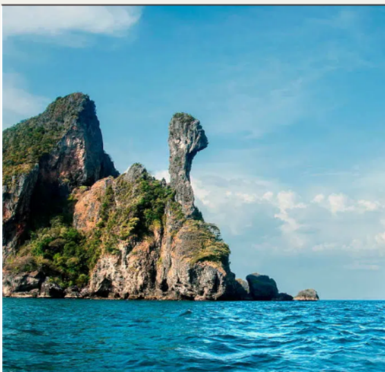
4 ISLAND TOUR CHICKEN ISLAND