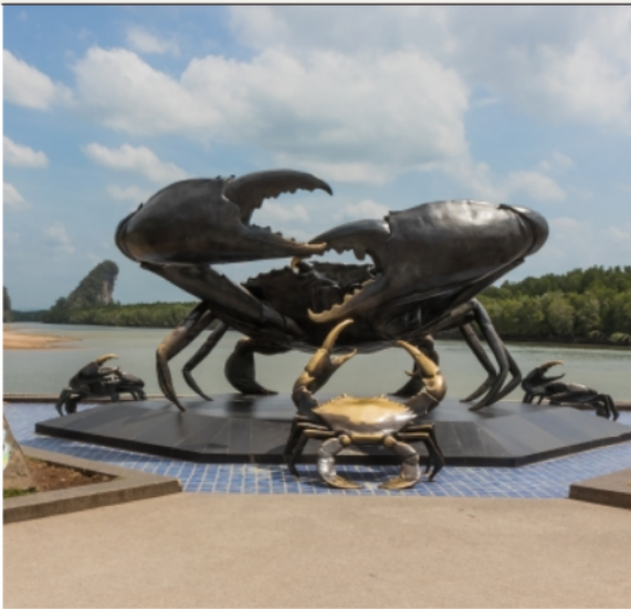
KRABI TOWN CRAB STATUE