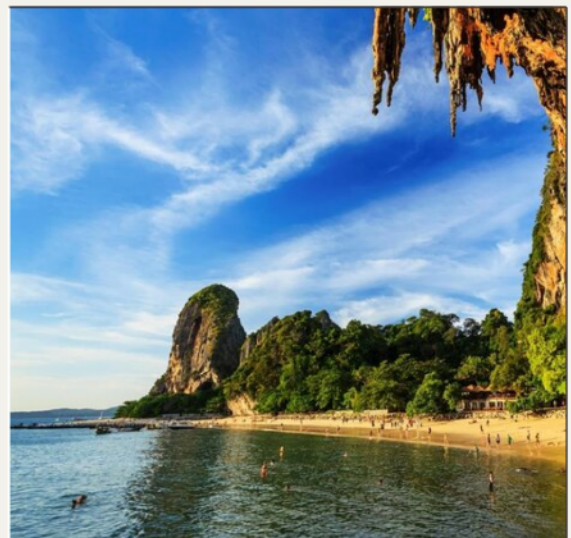
4 ISLAND TOUR PHRANANG BEACH