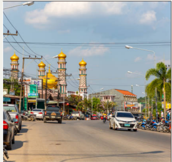
EXPLORE AONANG VIA FREE SCOOTER