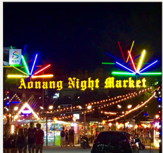
AONANG SHOPPING STREET