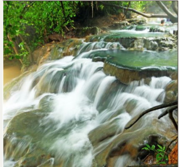
JUNGLE TOUR HOTSPRING