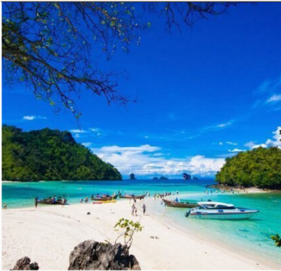
4 ISLAND TOUR TUB ISLAND