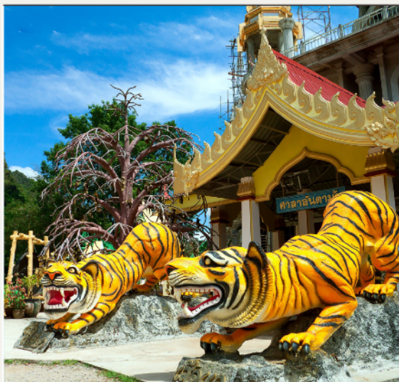
JUNGLE TOUR TIGER CAVE