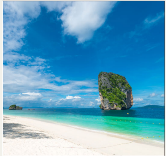
4 ISLAND TOUR PODA ISLAND