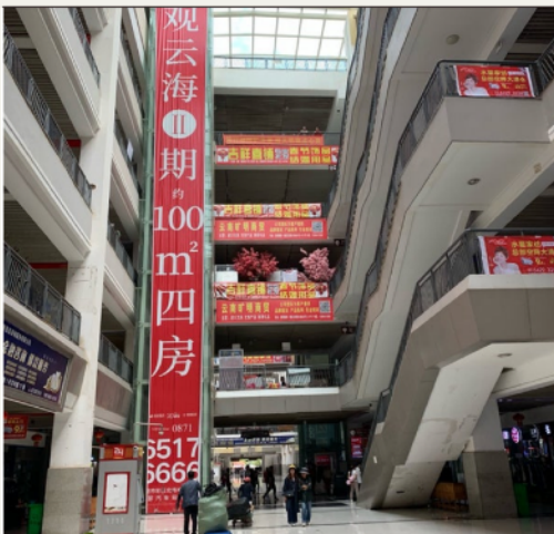
LUOSIWAN WHOLESALE MARKET