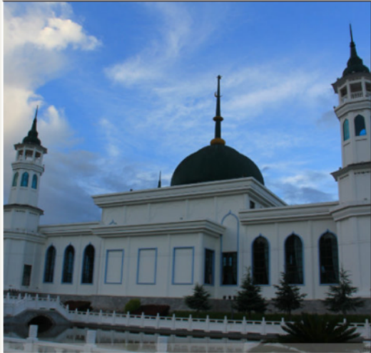
DALI NANMEN MOSQUE