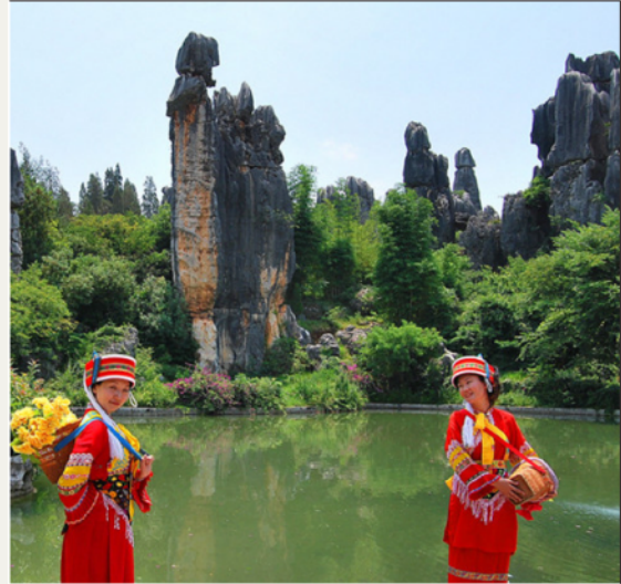
SMALL STONE FOREST