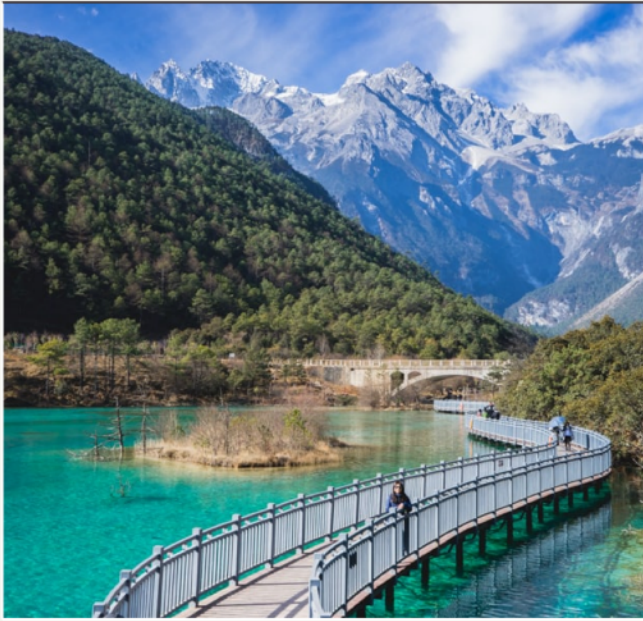
BLUE MOON VALLEY