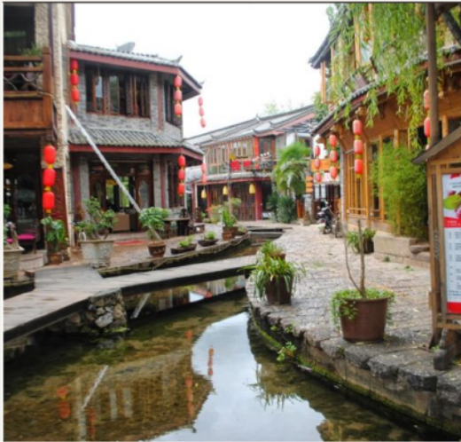
UNESCO WORLD HERITAGE SITE OF LIJIANG