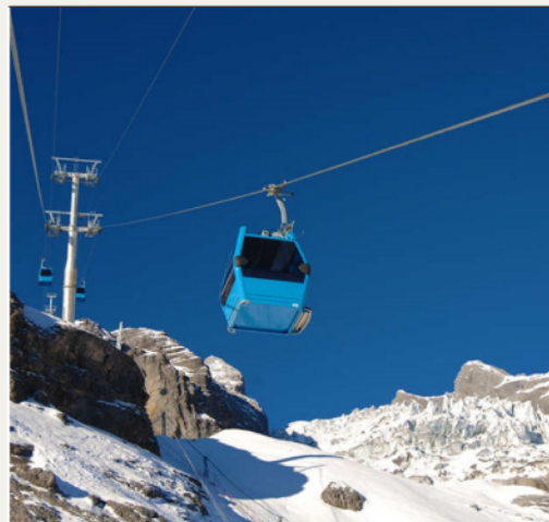
CABLE CAR RIDE