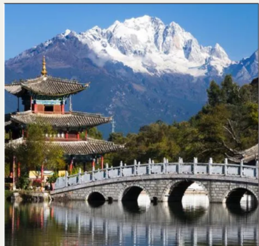
BLACK DRAGON POOL