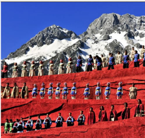
LIVE PERFORMANCE 'IMPRESSION LIJIANG'