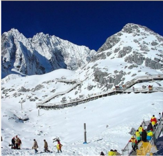
JADE DRAGON SNOW MOUNTAIN