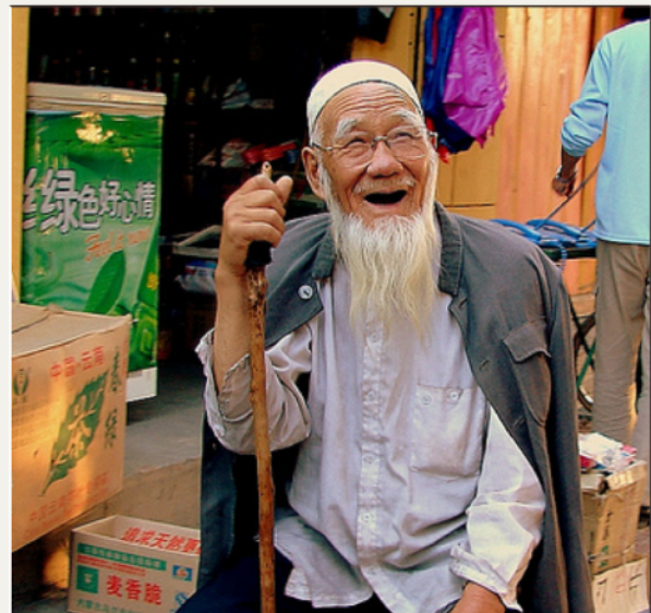
HUI MUSLIM FAMILY