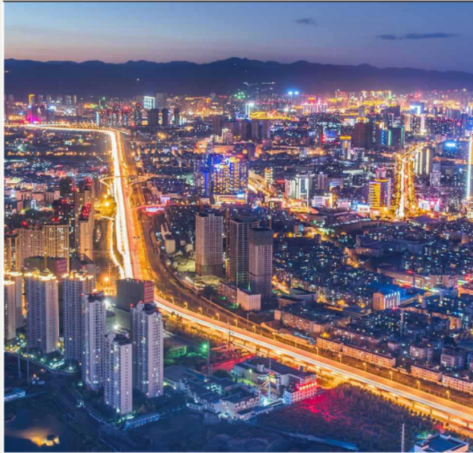
KUNMING CITY NIGHT VIEW