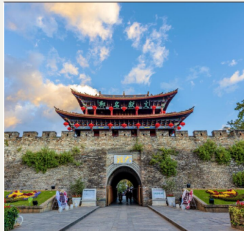
DALI OLD TOWN