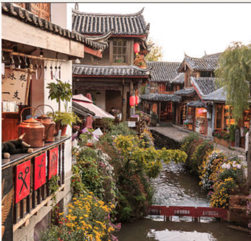
LIJIANG OLD TOWN