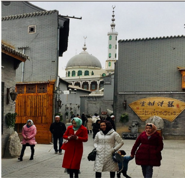
HUI MUSLIM VILLAGE