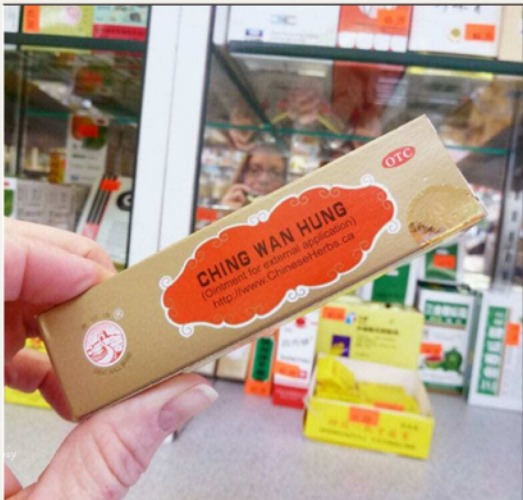
BURNING CREAM CENTER