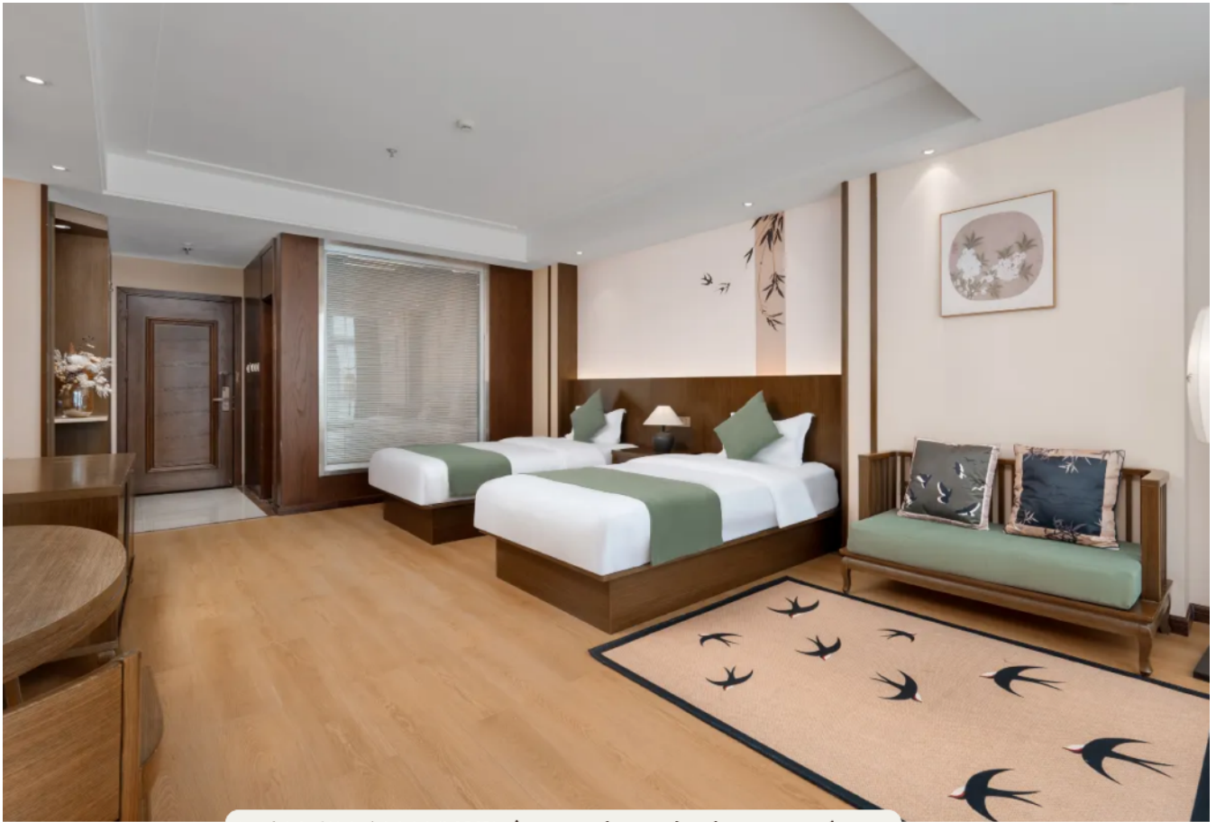
WAN JIN AN HOTEL | www.bossbabetravel.my