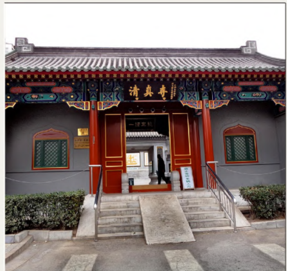
DONGXIN STREET MOSQUE