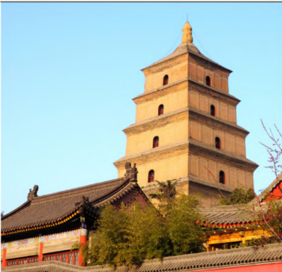
NORTH SQUARE OF BIG WILD GOOSE PAGODA