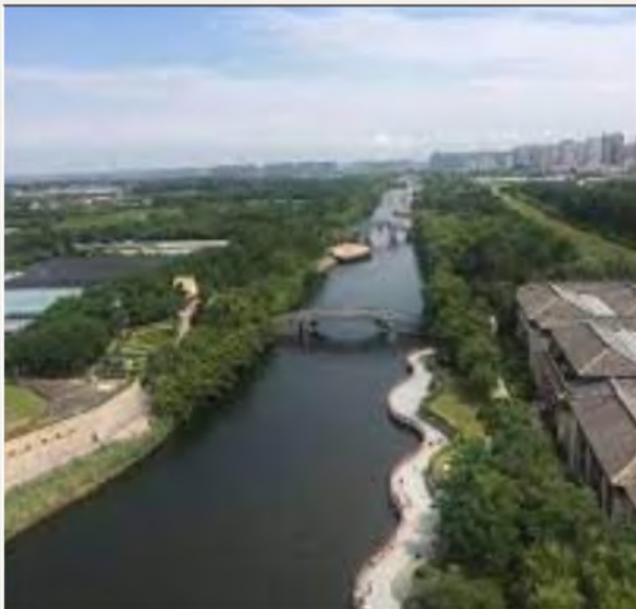
HANCHENG LAKE PARK