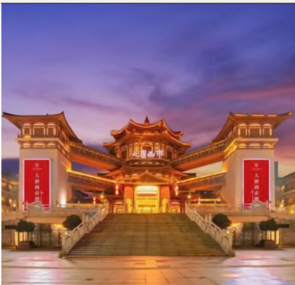
TANG WEST MARKET