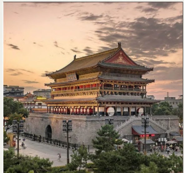
ANCIENT CITY WALL