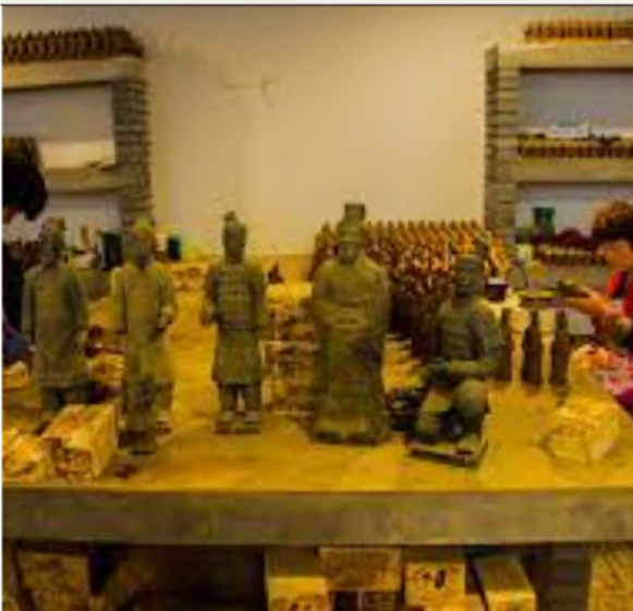
THREE COLOUR CERAMIC FACTORY