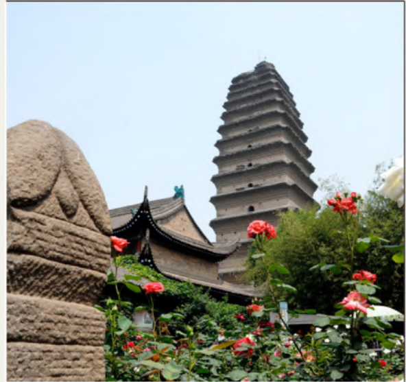
SMILE WILD GOOSE PAGODA