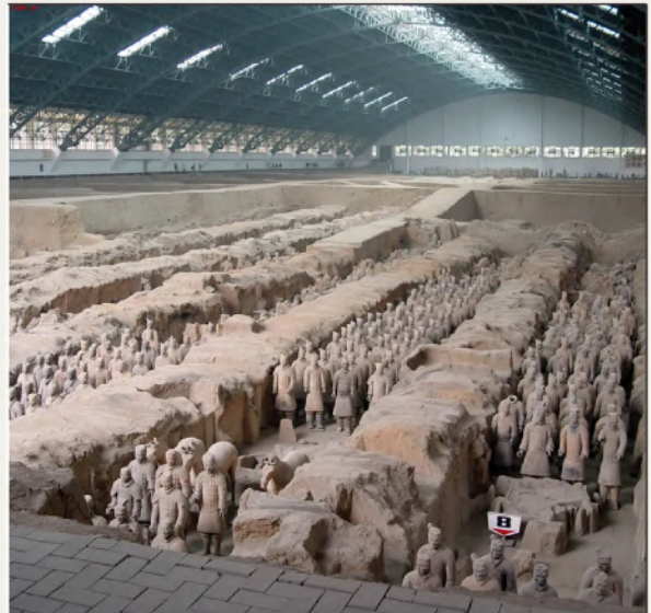
MUSEUM OF THE QIN TERRACOTA WARRIORS & HORSES