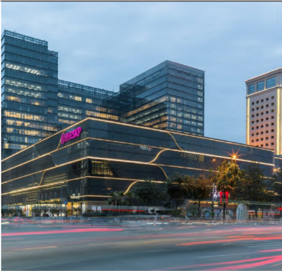
NORTHWEST COMMERCIAL WHOLESALE CENTRE