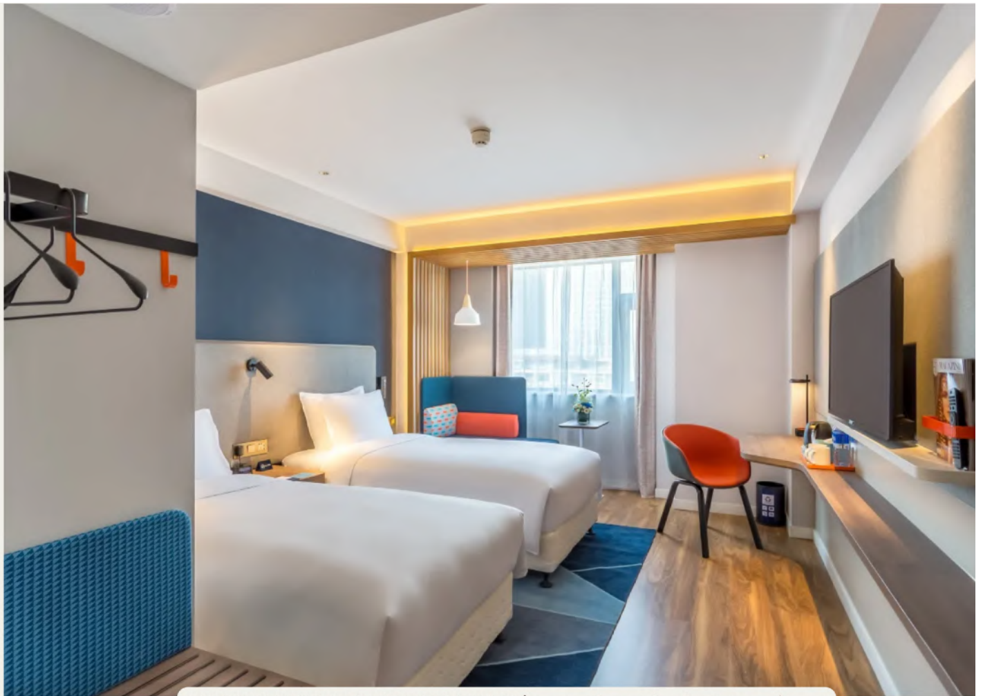
HOLIDAY INN EXPRESS XI'AN | www.bossbabetravel.my