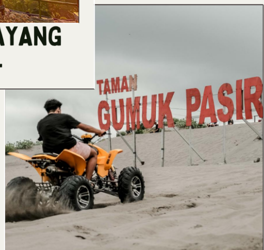
GUMUK PASIR (OPTIONAL)