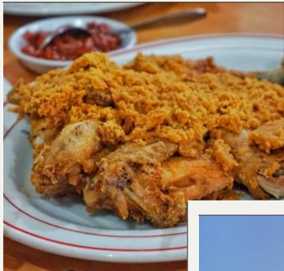
LUNCH AT AYAM GORENG NY SUHARTI